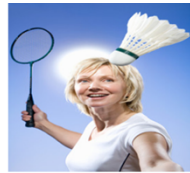
played (play) badminton