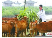
fed (feed) some cows