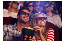
went (go) to the cinema