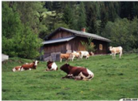
went (go) to a farm