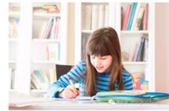
did (do) homework