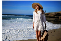
went (go) to the beach