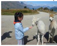
fed (feed) some sheep