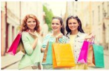
went (go) shopping