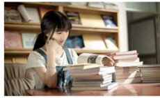
read (read) a book