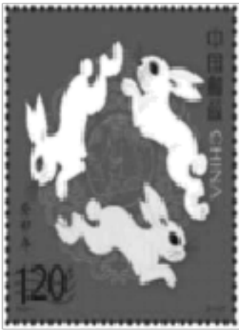
Postal goods for Year of the Rabbit

The Year of the Rabbit will start on Jan 22, the first day of Chinese New Year. Every year an artist is asked to design two zodiac stamps, and the designer for the Year of the Rabbit is Huang Yongyu, age 98, who has been asked to do the job several other times. One stamp shows a blue rabbit holding a pencil and an envelope and text wishing for wisdom(智慧); another stamp shows three rabbits colored white, yellow and light blue running head to toe in a circle with a red background. At the center is the Jade Rabbit, a company of Chang'e, the moon goddess in Chinese traditional story.