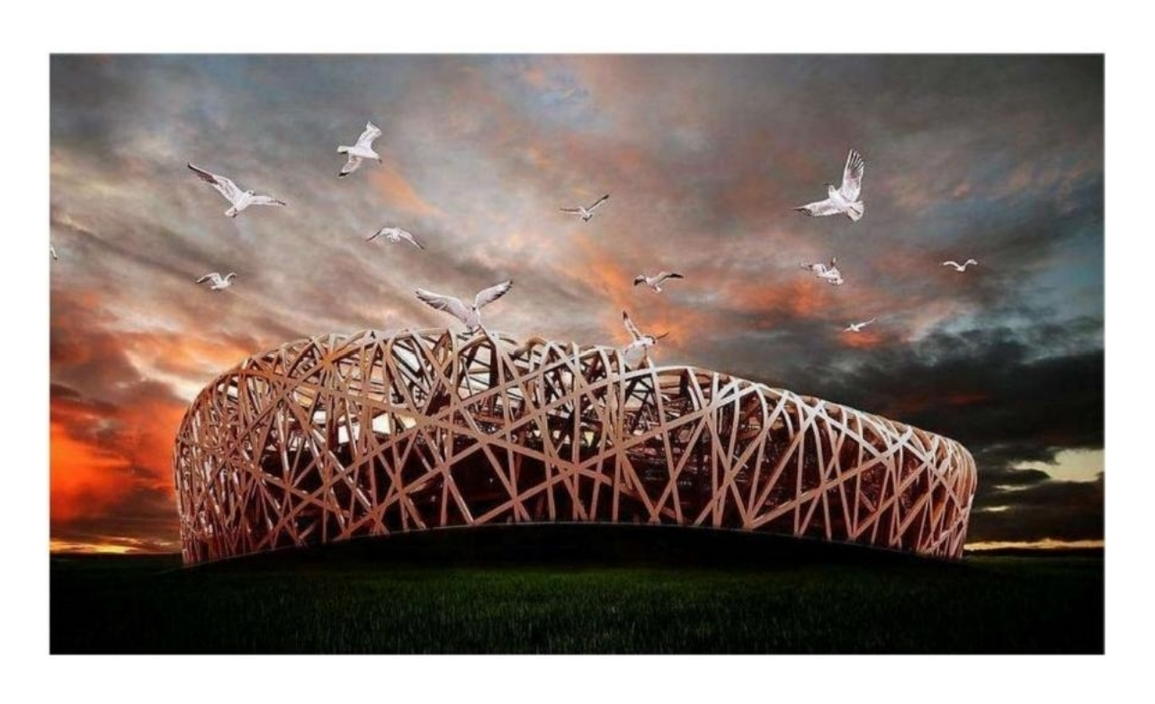
The Bird's Nest