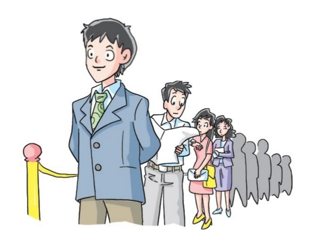
What is the man doing? He is queuing for his turn.