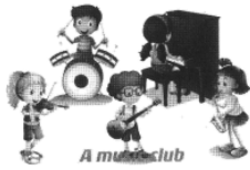
B. A music club