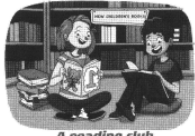
A. A reading club