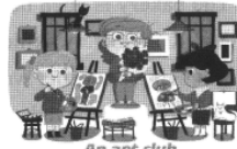
C. An art club